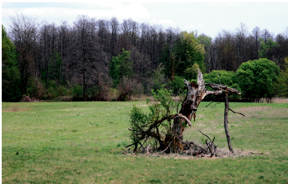
Fig. 6: Habitat of S. mesiaeformis near Draganci (NW Croatia).