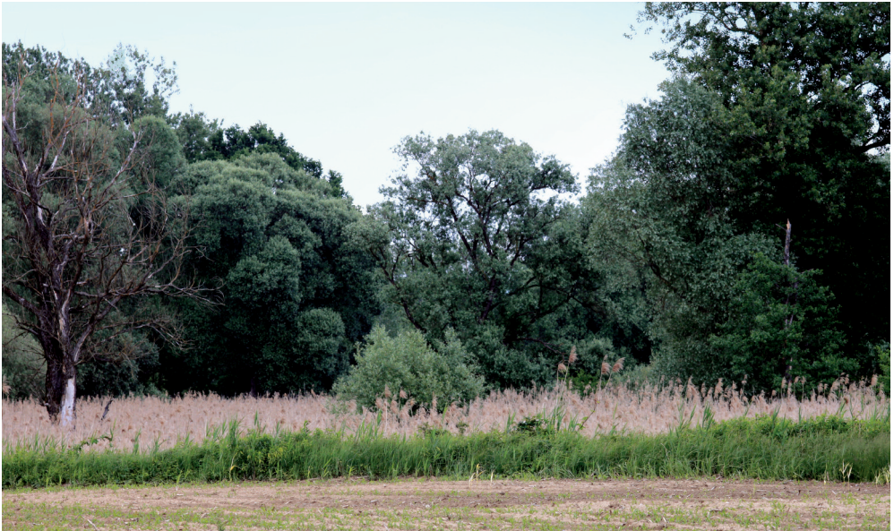
Fig. 4: A river bank as habitat of S. mesiaeformis in Muriša (NE Slovenia).

try in any of the major works about clearwings. In view of the distribution of the species close to the Hungarian side of the border, the mentioned finds were expected and the occurrence of S. mesiaeformis in Croatia is now confirmed. Old exit holes, larvae and