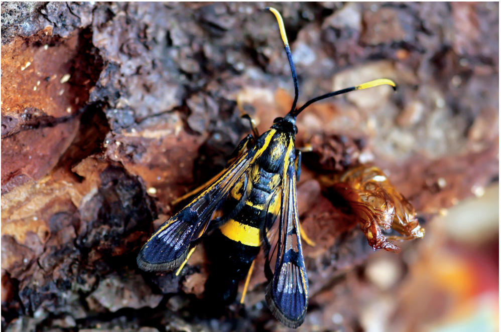
Fig. 3: A newly hatched female (wingspan 23 mm) sitting on the bark (Draganci, Croatia).

ding to De Freina (1997) it takes three years in northern Europe. The host plant of the monophagous larvae is black alder ( Alnus glutinosa (L.), Betulaceae), in which they live between the bark and the wood, usually in the lower parts of the trunk up to about