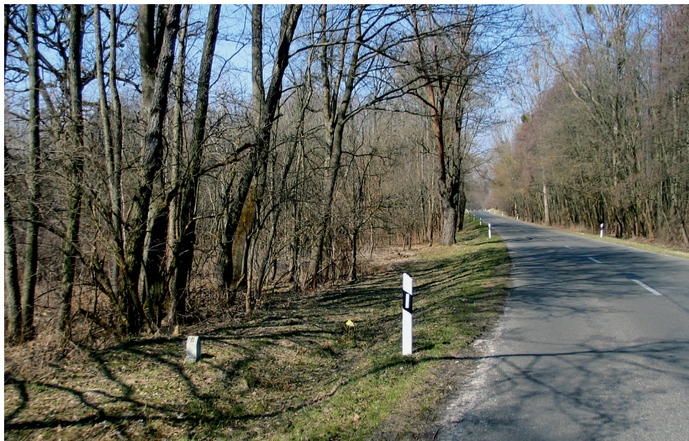
Fig. 7: Habitat of S. mesiaeformis near Nagyátad (SW Hungary).