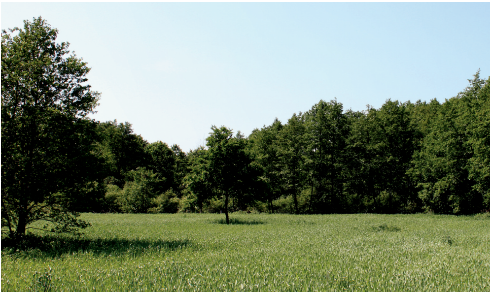
Fig. 5: Habitat of S. mesiaeformis in Muriša (NE Slovenia).

try in any of the major works about clearwings. In view of the distribution of the species close to the Hungarian side of the border, the mentioned finds were expected and the occurrence of S. mesiaeformis in Croatia is now confirmed. Old exit holes, larvae and