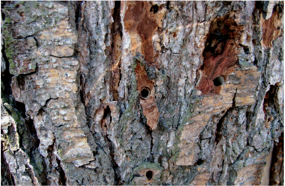
Fig. 1: Numerous old exit holes in the trunk of a host tree near Nagyátad (SW Hungary).

The bionomics of S. mesiaeformis is well studied (Saramo, 1973; Fibiger & Kristensen, 1974; De Freina, 1997; Špatenka et al., 1999; Laštůvka & Laštůvka, 2008; Lendel, 2011). The species has a similar biology to S. scoliaeformis and lives in lowland, where it often chooses trees that then serve several generations of the moth. According to most authors, its development takes two years, but according to recent observations in the southern Czech Republic, it can sometimes complete in one year, at least in central and southern Europe (Z. Laštůvka, personal communication). Accord-