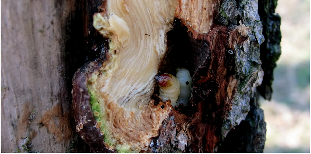
Fig. 2: Mature larva in its tunnel, near Nagyátad (SW Hungary).

ding to De Freina (1997) it takes three years in northern Europe. The host plant of the monophagous larvae is black alder ( Alnus glutinosa (L.), Betulaceae), in which they live between the bark and the wood, usually in the lower parts of the trunk up to about