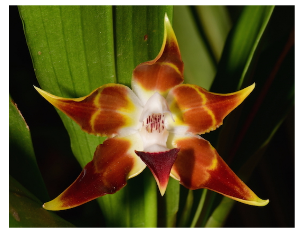
Huntleya colombovenezuelensis Uribe-Velez & Sauleda.