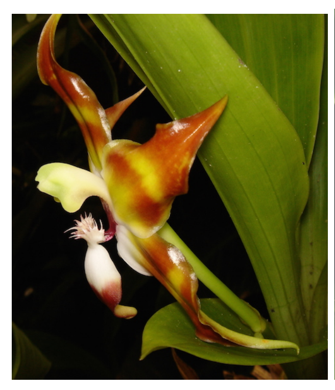
Huntleya apiculata (Rchb. f.) Rolfe.