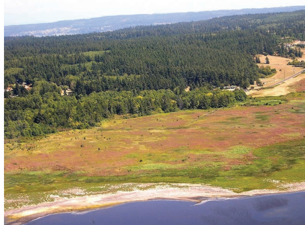
FIG. 1. Epilobium hirsutum infestation (pink-tinged vegetation) near Crockett Lake, Whatcom County, WA (photo by S. Horton).

Mompha epilobiella was collected relatively recently in New York and Quebec (Sinev 1996). We report here the first records of M. epilobiella from the western